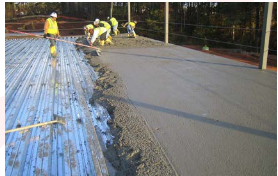
Composite Steel Deck